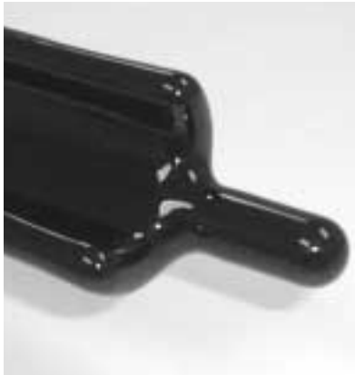
Glass-lined TMI Sensor end shown on a Pfaudler Concave baffle.