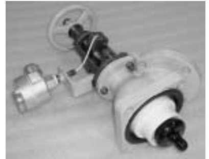
Glass-lined TMI Sensor shown on Pfaudler Flush Valve head and stem.